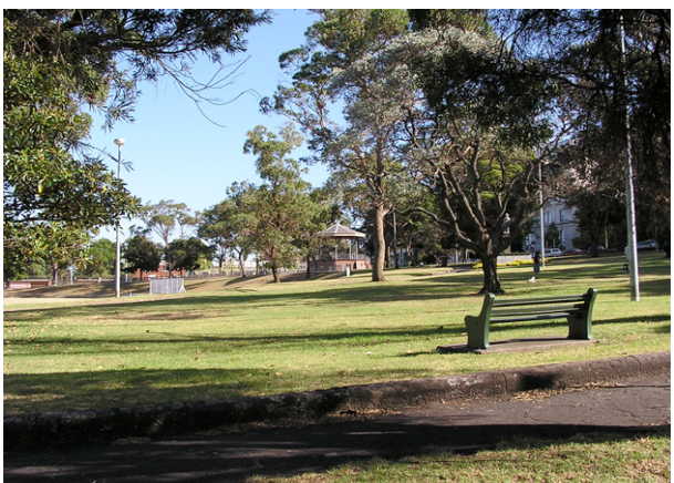
Figure 10.5. The streetscape of Fowler Street includes some mature trees that help to extend the open space qualities into the surrounding area.