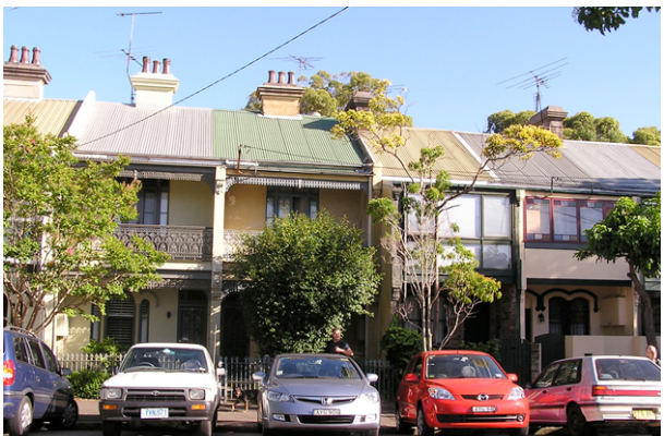
Figure 10.21. The rear of the Pidcock Street terraces are highly visible from Mallett Street. The survival of the original form of a group such as a terrace of this scale without any major extensions is rare.