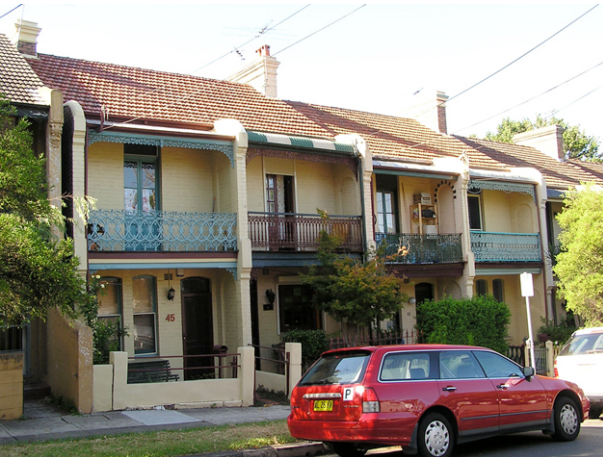
Figure 10.11 and 10.12. Terraces to Fowler Street are simple and step down the hill under paired roofs. Those at the eastern end are narrow examples of their type. The streetscape quality of the group is high..