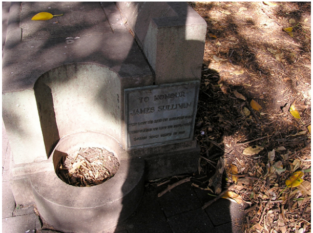
Figure 10 .9 and 10.10. The closure is also marked by the Sullivan RSPCA horse water trough with a separate bowl for dogs at the end (now disused).