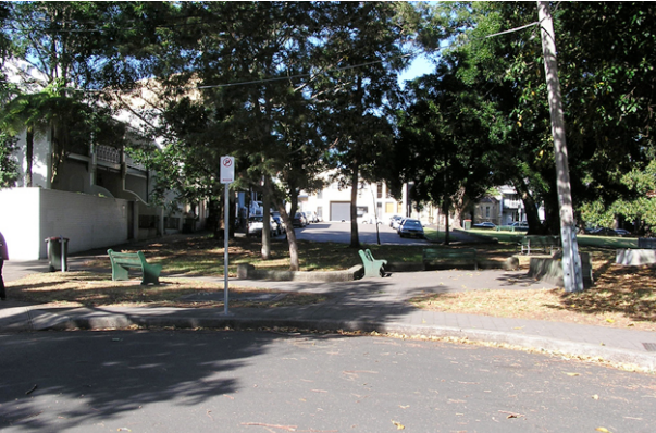
Figure 10.7 and 10.8. Fowler Street is truncated by a street closure near Gibbons Street. This space has an oasis quality due to the deep shade created by the ficus trees.