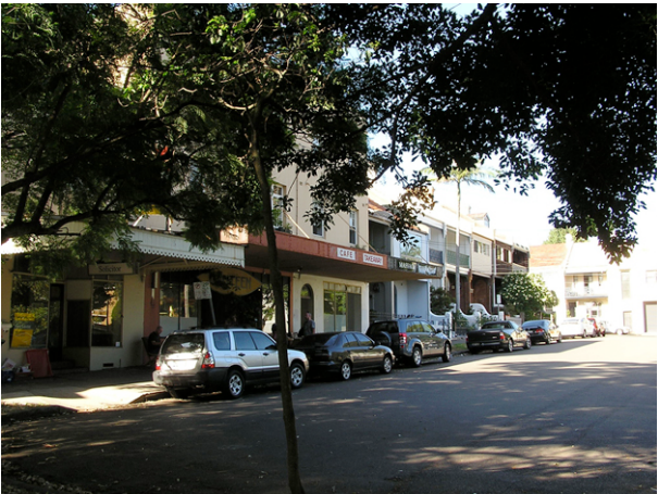
Figure 10.15 and 10.16. A small group of shops at the southern end of Camperdown Park provides a focal point for the area. The shops have retained their original facades with ingo entrances. The awning to the small shop in figure 10.15 is fringed by a decorative valance.