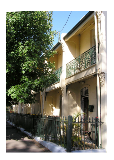
Figure 10.20. The northern end of Camperdown Park is also lined by groups of terraces. The lack of dividing walls and use of iron palisade fences between properties establishes a spacious streetscape character.