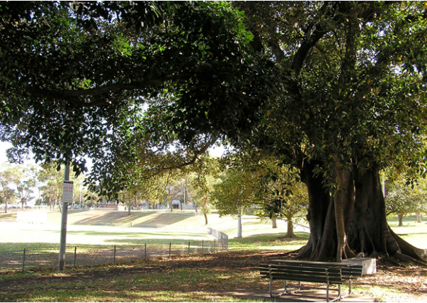
Figure 10.3 and 10.4. Camperdown Oval was created after the closure of the Fowlers Pottery Works pit and is a simple open space surrounded by mature ficus plantings. Its northern end is devoted to recreational facilities such as tennis courts and bowling greens with two simple banked grandstand seating areas overlooking the oval. The southern end integrates with the streetscape at the intersection of Fowler and Gibbons Streets.