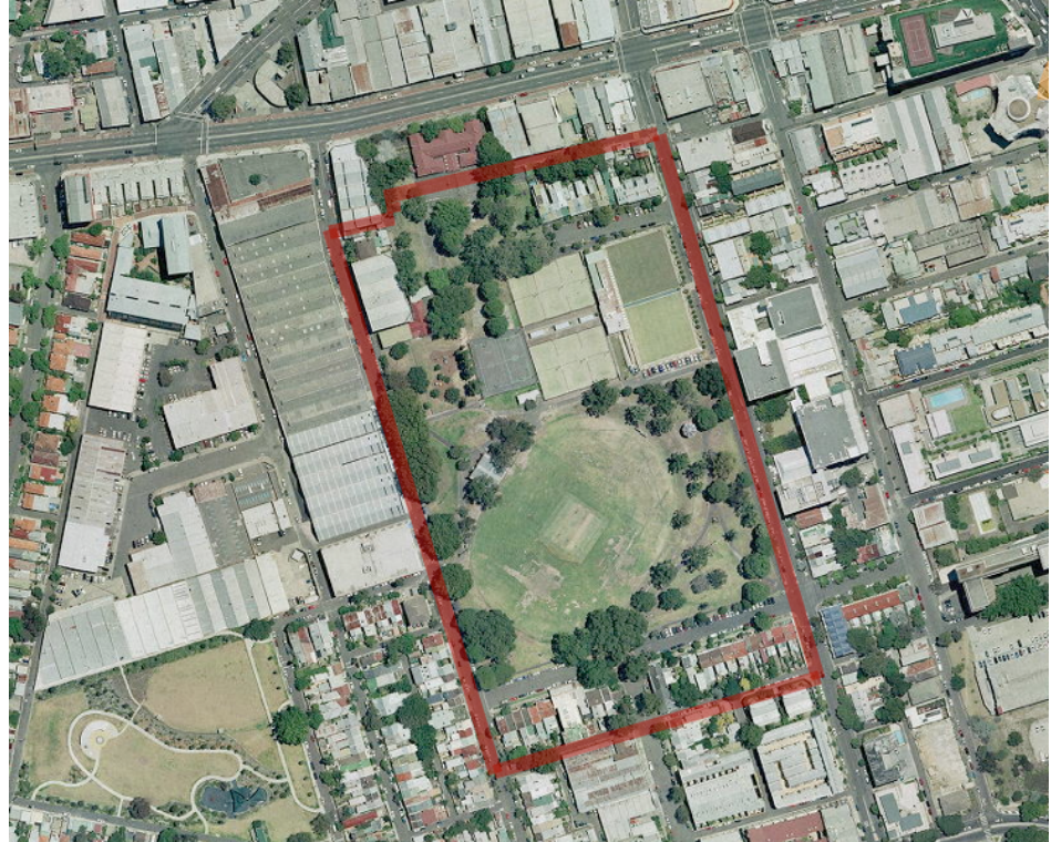
Figure 10.2 The Area in 1943 and 2009. The zigzag lines in the park in the 1943 photograph are an air raid shelter.