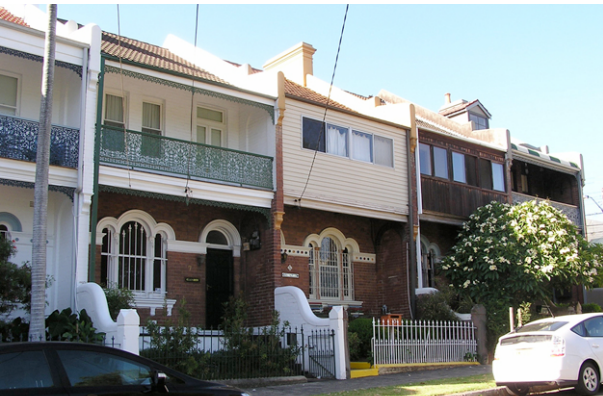
Figure 10.17 and 10.18. The terrace facing the south western corner of Camperdown Park is more substantial and demonstrates a combination of Victorian and Federation influences. Some balconies have been infilled but these changes are largely reversible. The prevailing iron palisade fence can also be seen.