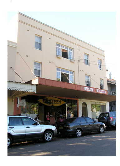
Figure 10.19. The shop is part of a relatively substantial commercial group that is a prominent element in the internal views from Camperdown Park.