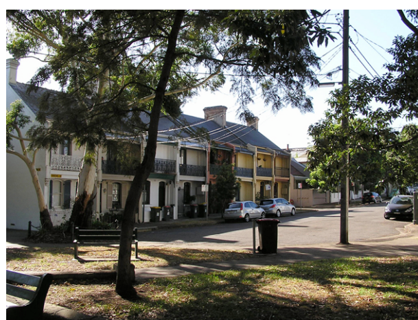
Figure 10.14. The Gibbons Street terrace forms a strong streetscape element through its unity of built form and detailing, terminating in the road closure at the southern end of Camperdown Park.